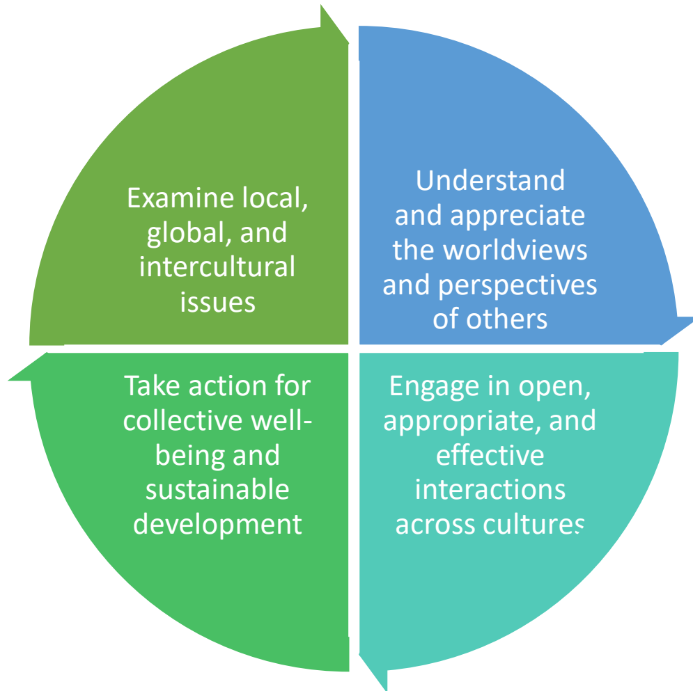
Figure 1. Dimensions of global competence. Adapted from Asia Society & OECD. (2018).

In addition to the need for global competence because of increasing global interconnectedness, increased global migration has led to more diversity in local schools throughout the U.S. Based on the last census, the U.S. is home to a near record 12.9% foreign-born residents (US Census, 2011). Students need to be able to understand diverse perspectives and empathize with people who are fleeing their home countries looking for better lives in the U.S.